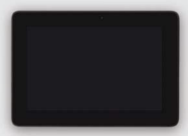
Main Device S30853-H4001-R101