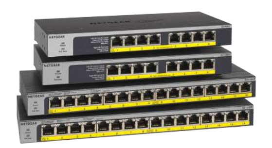
GS108LP, GS108PP, GS116LP, GS116PP